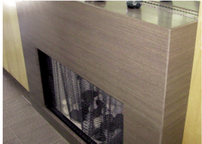
Honed fireplace & Flamed floor