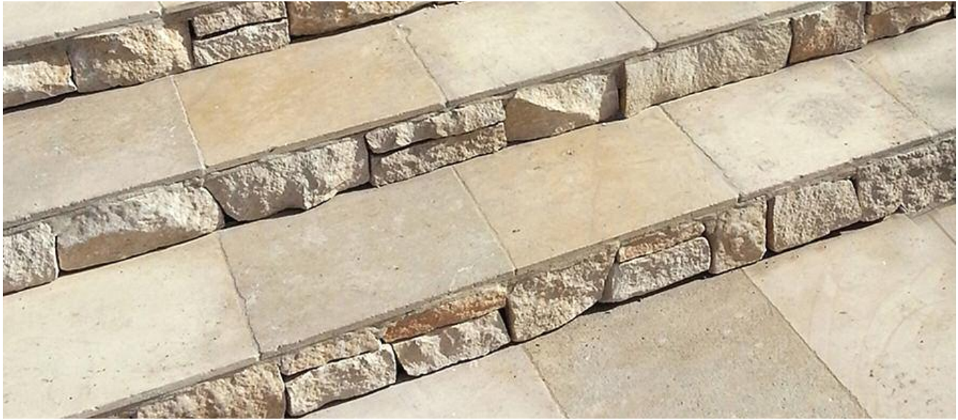
16 x Free Length x 5/8 (above image: treads have been cut to size)

Coveted the world over for its distinctive warm colors and tres belle appeal, the French Limestone Collection stands apart. Stock-FOB Los Angeles warehouse. Custom sizes & finishes may be subject to minimum quantities & lead time. Sizes are approximate and may vary slightly. Stone is a natural product, please expect some beautiful color variation.